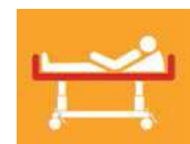
PATIENT'S BED EXIT